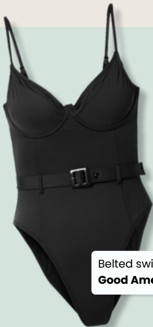
Belted swimsuit Good American | Shop the look

I love a swimsuit because they can easily work as a top when worn with a cool pair of trousers. Alternate with a bikini to even out your tan.