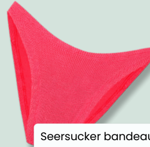
Seersucker bandeau bikini Hunza G | Shop the look