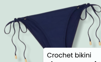
Crochet bikini Zimmermann | Shop the look