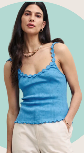
Daisy chain trim top Nobody's child | Shop the look