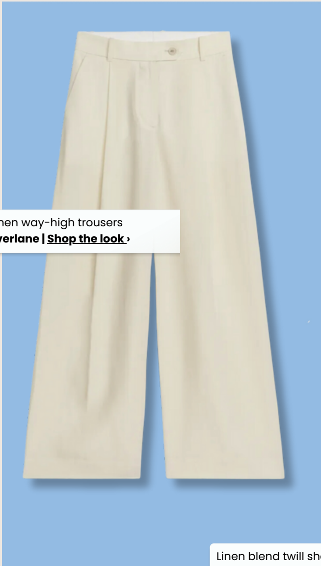
Linen way-high trousers Everlane | Shop the look

I recommend packing at least two pairs of trousers, both in breathable materials like linen and both in colours that will work well with the rest of your pieces.