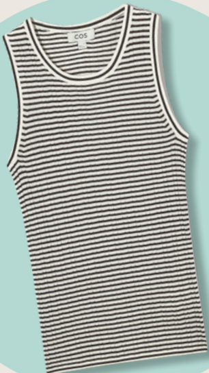
Rib knit silk tank top COS | Shop the look