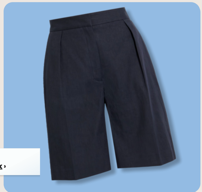
Linen blend twill shorts Iris&Ink | Shop the look