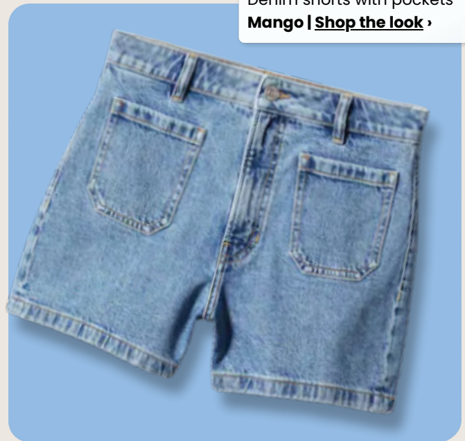
Denim shorts with pockets Mango | Shop the look