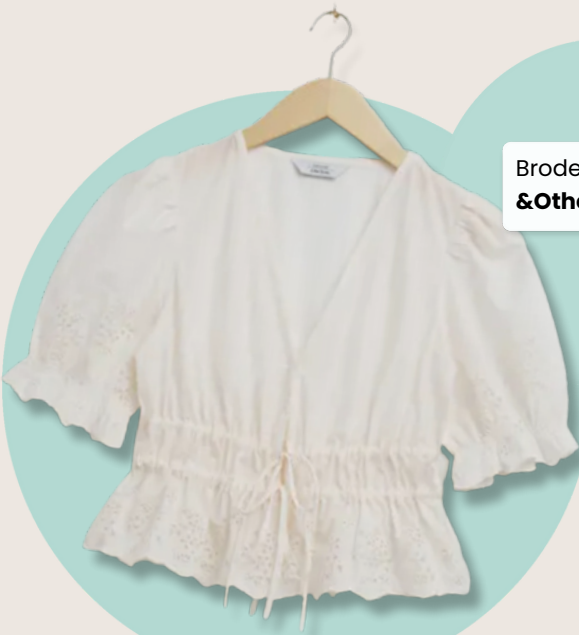
Broderie Anglaise Puff Sleeves Blouse &OtherStories | Shop the look

Choose a few tops that you can wear from day to night. Neutral colours and floaty fabrics are ideal.