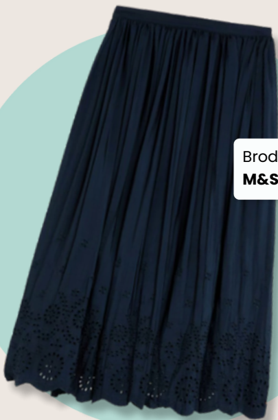
Broderie Midi Skirt M&S | Shop the look

Of course, skirts are a valid option if you prefer! I love a satin skirt – they take up literally no space in a suitcase and can be worn during the day with your sandals and in the evening with heels.