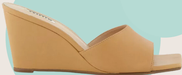
Leather open toe mules Dune | Shop the look