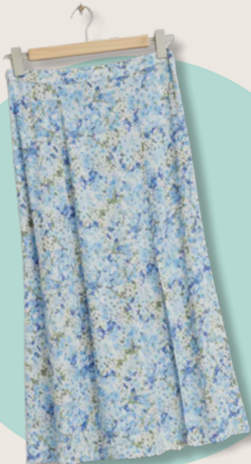
Side slit midi skirt &OtherStories | Shop the look