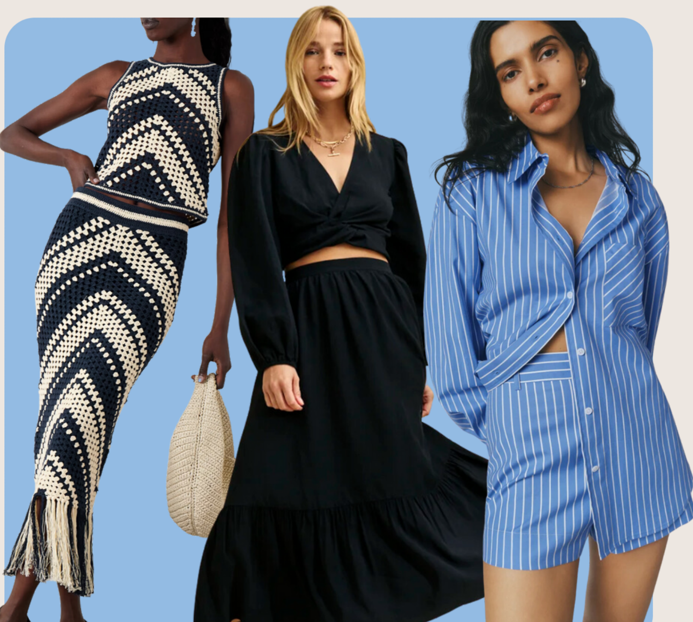
Crochet co-ord Zimmermann | Shop the look

Co-ords are this season go-to cool summer pick. Shorts, shirts, trousers - monochrome or colour, plan or patterned, the choice really is endless. An essential summer capsule piece