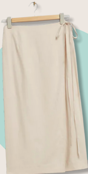
Wrap midi skirt &OtherStories | Shop the look