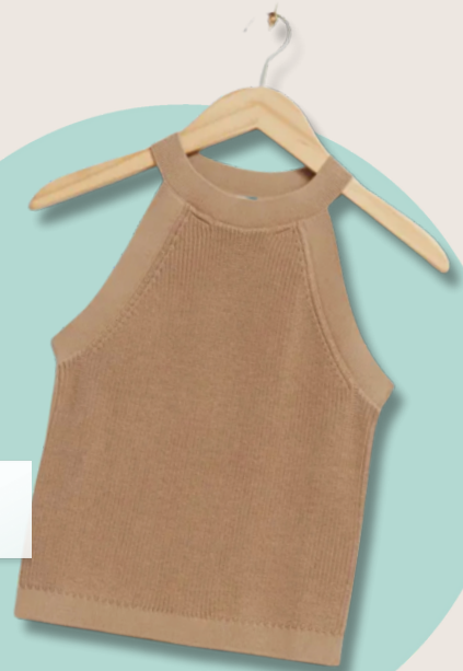
Halter neck knit top &OtherStories | Shop the look ›