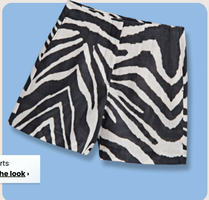
Zebra printed linen shorts Massimo Dutti | Shop the look