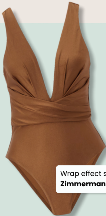
Wrap effect swimsuit Zimmerman | Shop the look

I love a swimsuit because they can easily work as a top when worn with a cool pair of trousers. Alternate with a bikini to even out your tan.