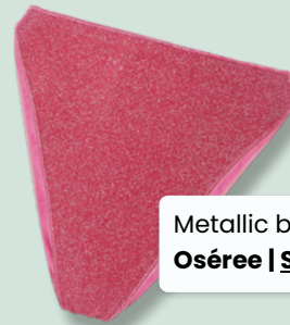
Metallic bikini Oséree | Shop the look