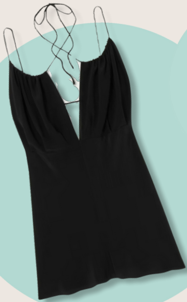
Silk crepe de chine camisole Toteme | Shop the look ›

Choose a few tops that you can wear from day to night. Neutral colours and floaty fabrics are ideal.