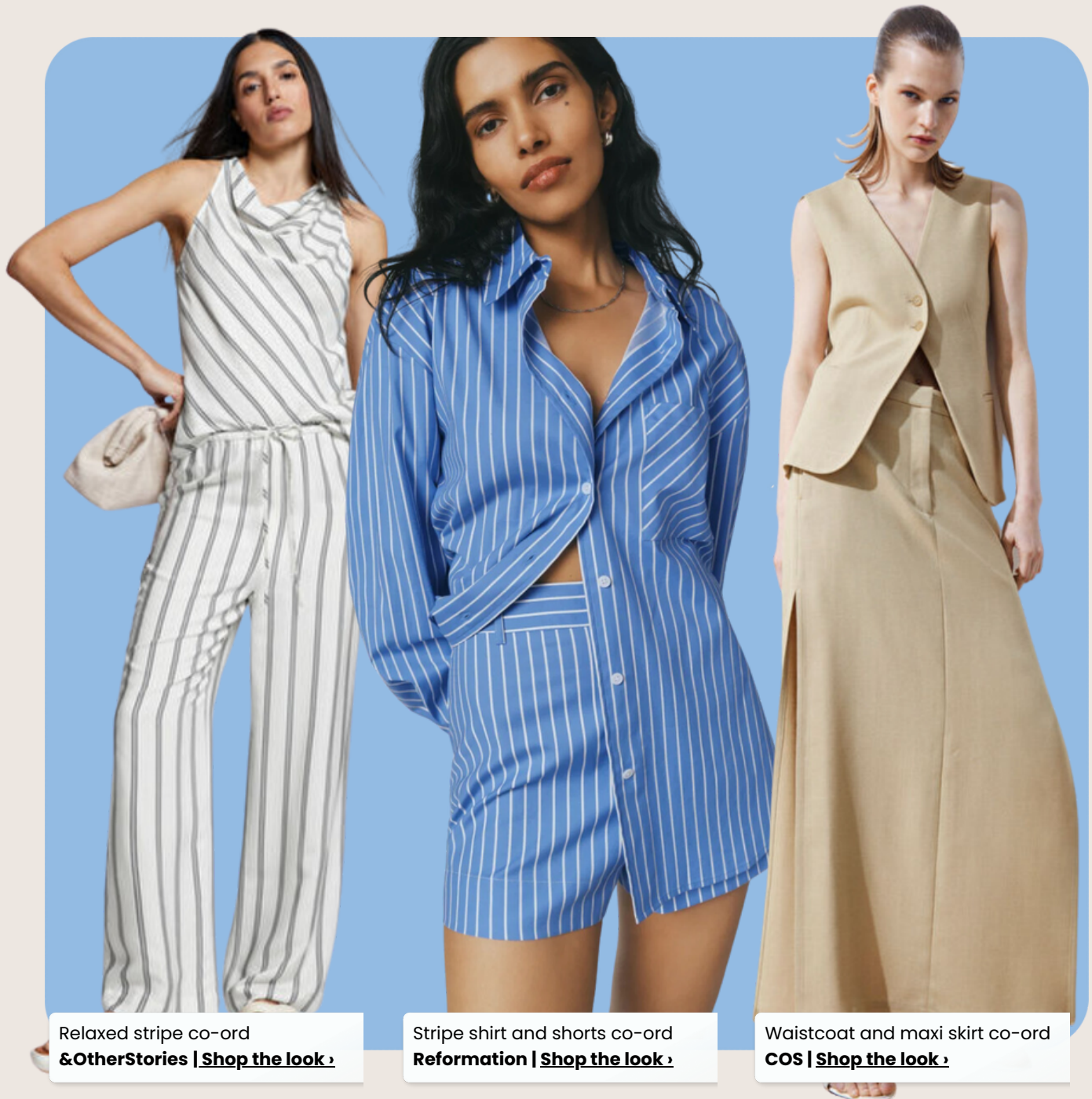
Relaxed stripe co-ord &OtherStories | Shop the look

Co-ords are this season go-to cool summer pick. Shorts, shirts, trousers - monochrome or colour, plain or patterned, the choice really is endless. An essential summer capsule piece