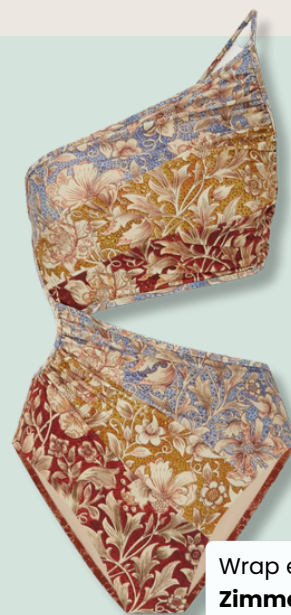
Wrap effect swimsuit Zimmerman | Shop the look