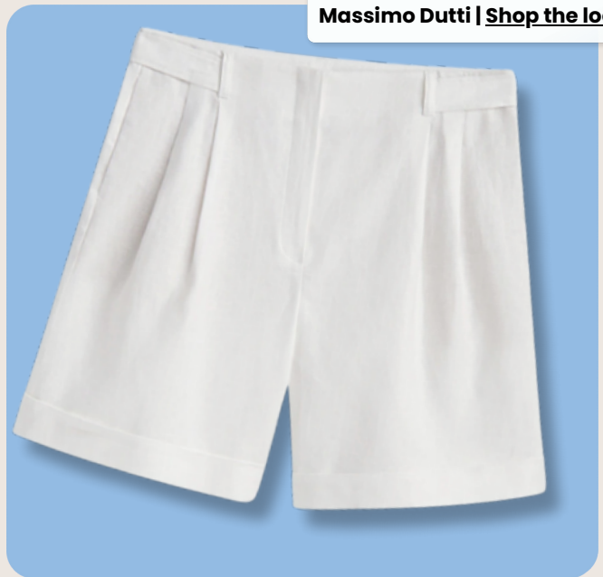
Linen bermudas Massimo Dutti | Shop the look