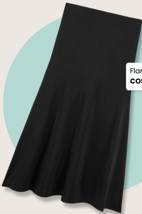
Flared silk skirt COS | Shop the look

Of course, skirts are a valid option if you prefer! I love a satin skirt - they take up literally no space in a suitcase and can be worn during the day with your sandals and in the evening with heels.