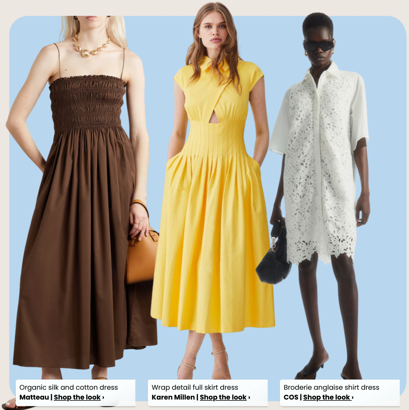
Organic silk and cotton dress Matteau | Shop the look ›

Dresses are the star of my summer looks. Go for neutral staples that don't require ironing. Pack a few options that you can dress up or down in an instant.