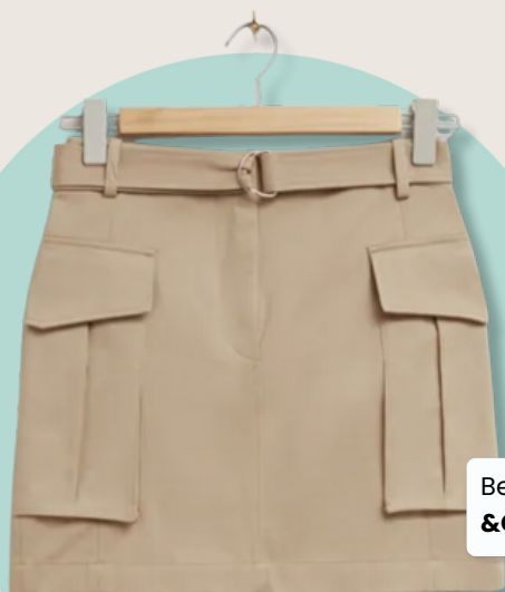
Belted Cargo skirt &OtherStories | Shop the look ›