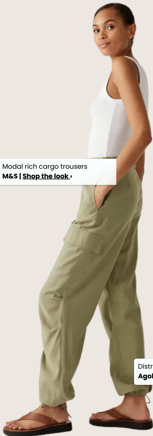
Modal rich cargo trousers M&S | Shop the look

I recommend packing at least two pairs of trousers, both in breathable materials like linen and both in colours that will work well with the rest of your pieces.