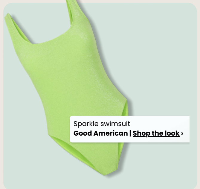
Sparkle swimsuit Good American | Shop the look