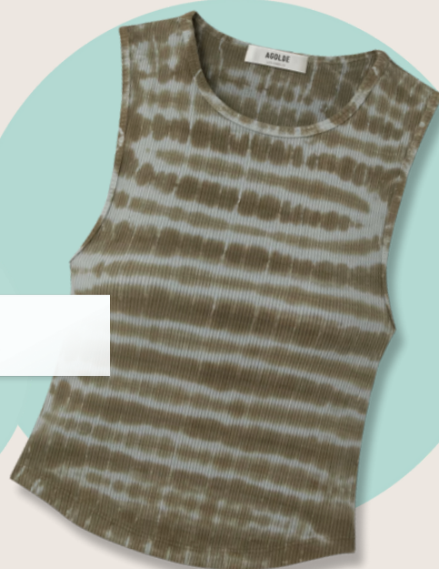
Tie-dyed tank top Agolde | Shop the look