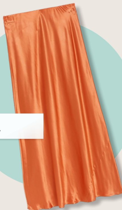
Satin midi skirt M&S | Shop the look ›