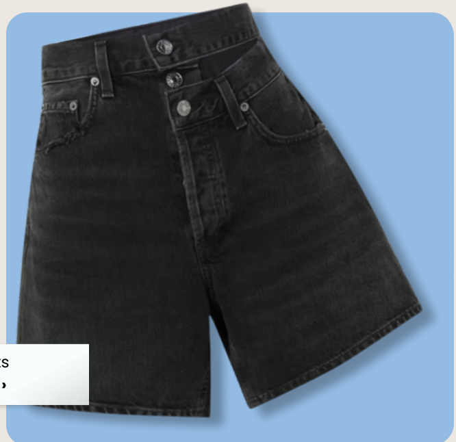
Distressed denim shorts Agolde | Shop the look