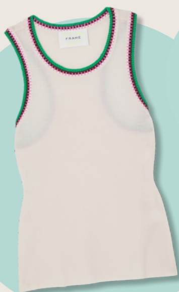
Crochet trimmed tank top Frame | Shop the look

Choose a few tops that you can wear from day to night. Neutral colours and floaty fabrics are ideal.