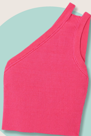
One-shoulder crop top Jacquemus | Shop the look