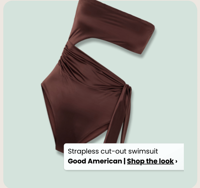
Strapless cut-out swimsuit Good American | Shop the look