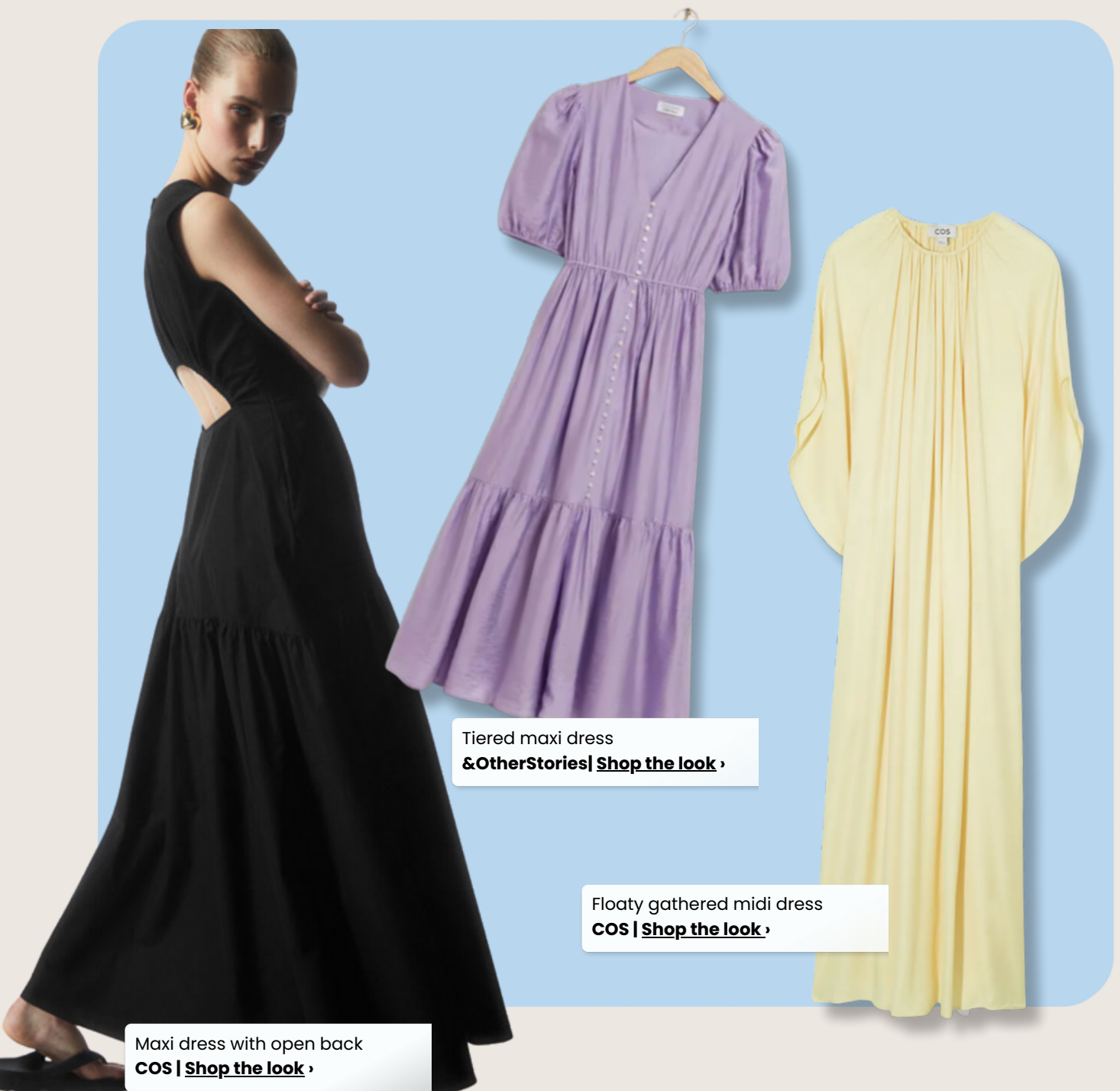
Tiered maxi dress &OtherStories | Shop the look ›

Dresses are the star of my summer looks. Go for neutral staples that don't require ironing. Pack a few options that you can dress up or down in an instant.