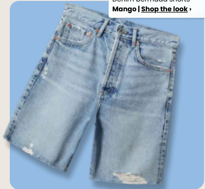
Denim bermuda shorts Mango | Shop the look